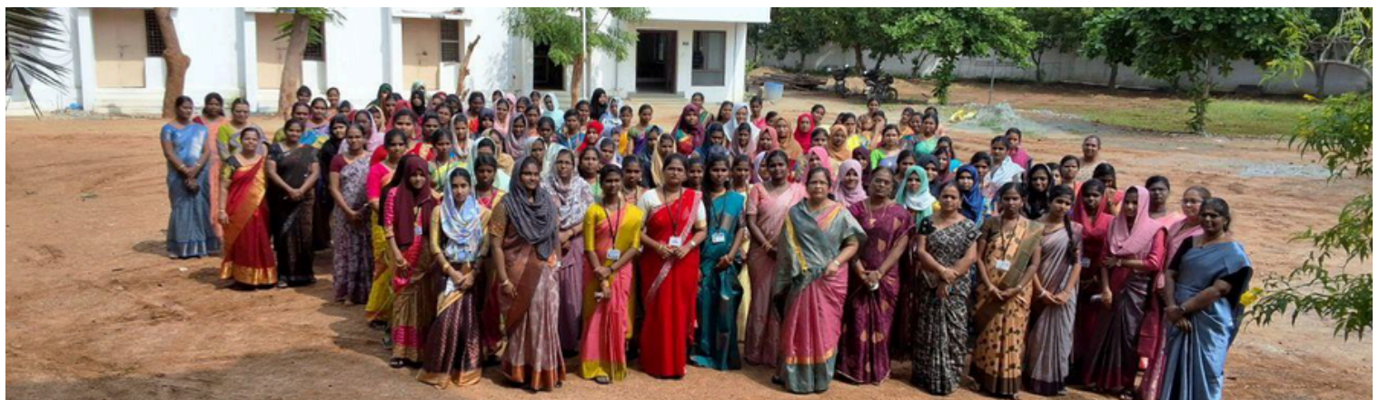
World Saree Day was celebrated on 21 st December 2024 to honour the timeless elegance and cultural significance of sarees, symbolizing India's rich heritage and diversity. Students paraded on the college ground, flaunting their stunning sarees, which were captured beautifully. The parade was a vibrant display of colours, patterns, and designs, reflecting India's rich textile heritage. The Principal of Annai Hajira Women's College, highlighted the historical significance of World Saree Day, emphasizing the importance of preserving traditional crafts and honouring the weavers who bring these exquisite garments to life.