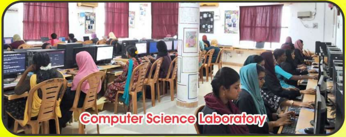
Computer Science Laboratory