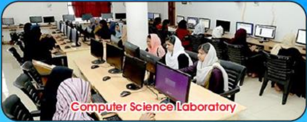
Computer Science Laboratory