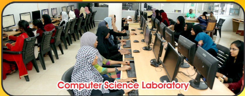
Computer Science Laboratory